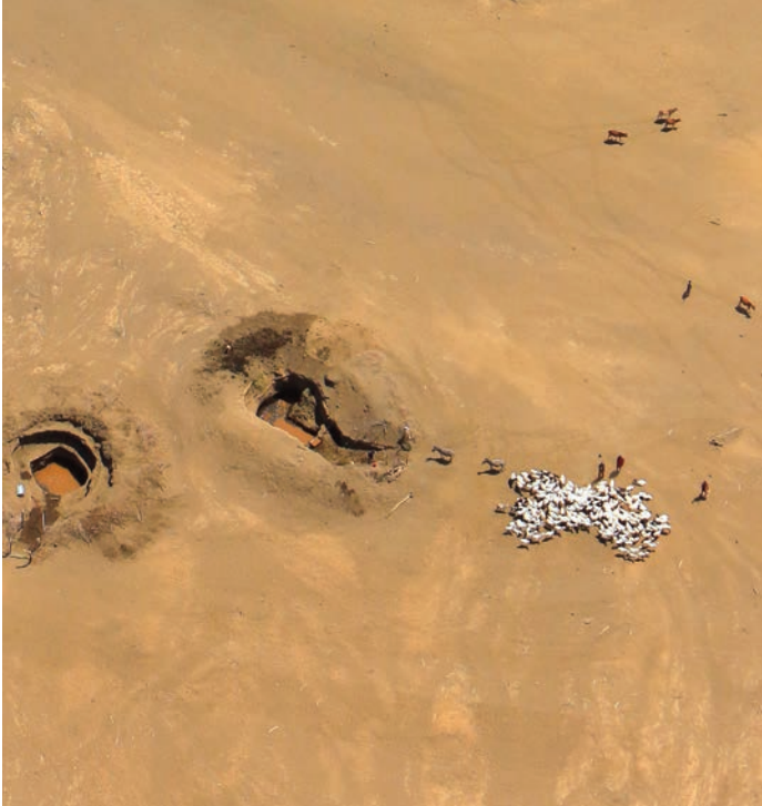
Brot für die Welt / Heinrich Böll Stiftung | 21

Right: Aerial view of Maasai herders taking their livestock to water holes in the Great Rift Valley near Lake Turkana, Kenya.