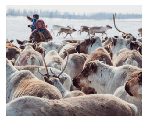
Brot für die Welt / Heinrich Böll Stiftung | 17

Reindeer herders practising traditional normadic husbandry.