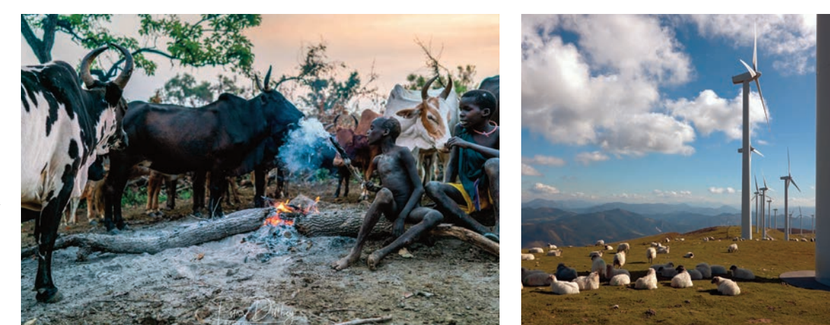
Brot für die Welt / Heinrich Böll Stiftung \mid 35

Left: Ethiopia Kibish cattle camp.