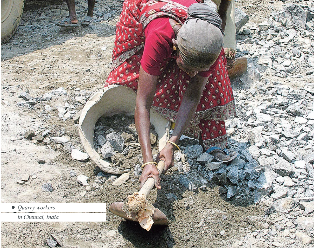
● Quarry workers in Chennai, India