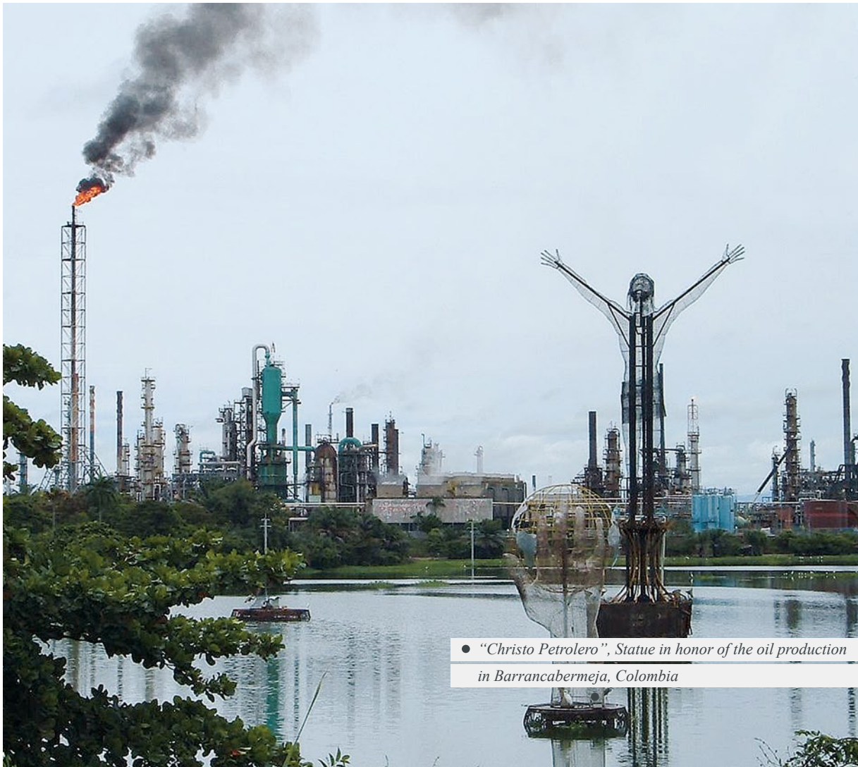
● “Christo Petrolero”, Statue in honor of the oil production in Barrancabermeja, Colombia