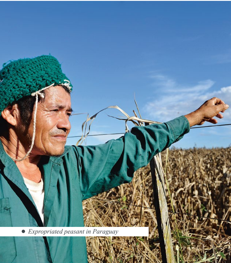
● Expropriated peasant in Paraguay

major Western transnational corporations often invest in land for agricultural use. 14 European and North American agricultural corporations secure land predominantly to grow crops such as corn, sugar cane and oleiferous plants for energy production. 15 There are countless globally active companies operating in the field of extractive production of raw materials like coal or precious metal mining. 16 These companies develop and operate mines