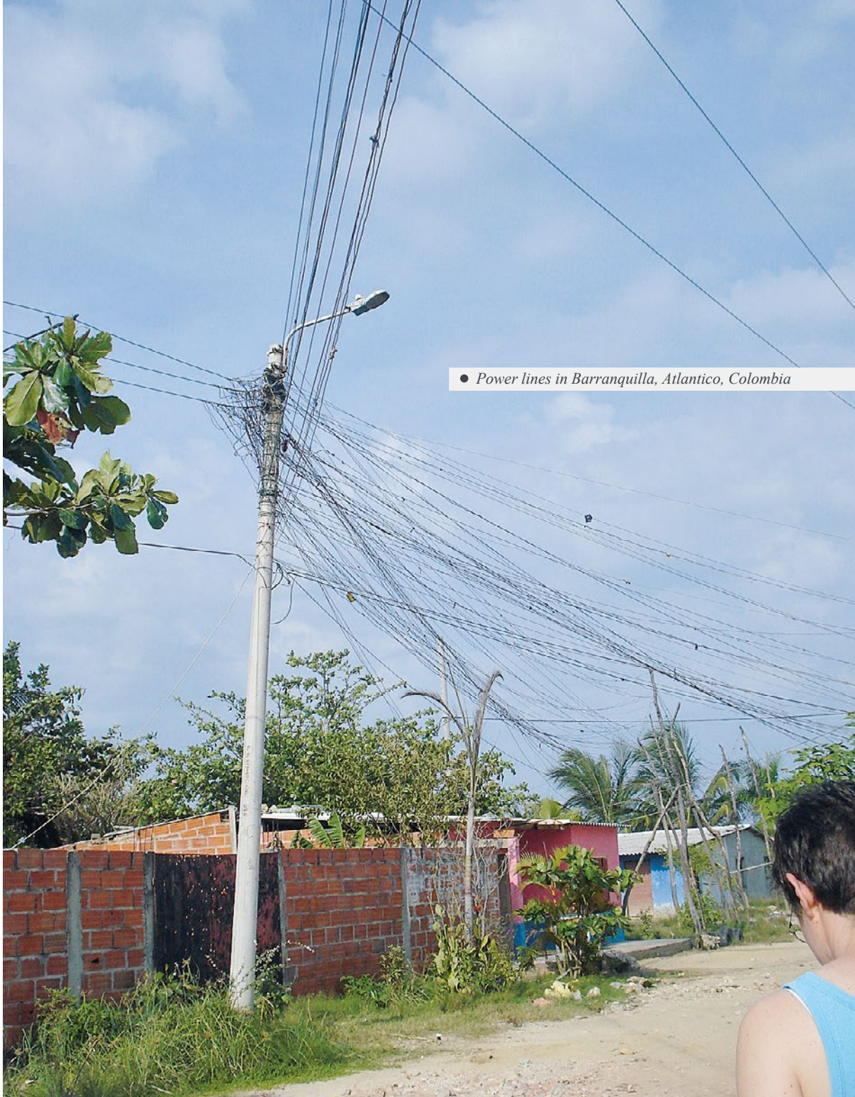
● Power lines in Barranquilla, Atlantico, Colombia