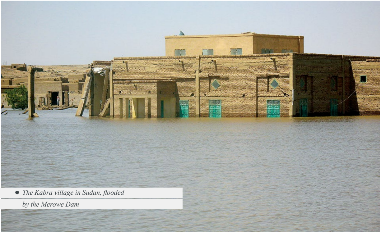
● The Kabra village in Sudan, flooded by the Merowe Dam