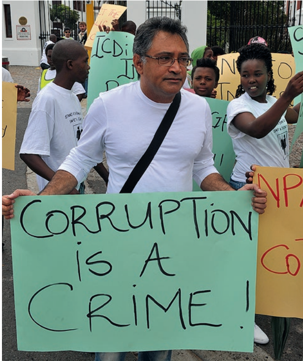
SPF supporters might make common cause with anti-corruption campaigners as less corruption can mean more funding for SPF. Protest against Corruption in Cape Town.

Taxation of exports, however, has remained important for countries exporting a generally limited number of commodities, especially minerals such as petroleum or copper, but also agricultural products. In some cases, the “export” is actually a service provided in the country to visiting foreigners, namely tourism, on which many small island developing countries depend. In that case, the taxes are likely to be imposed as tourist visas or excise taxes on transportation or on hotel stays.