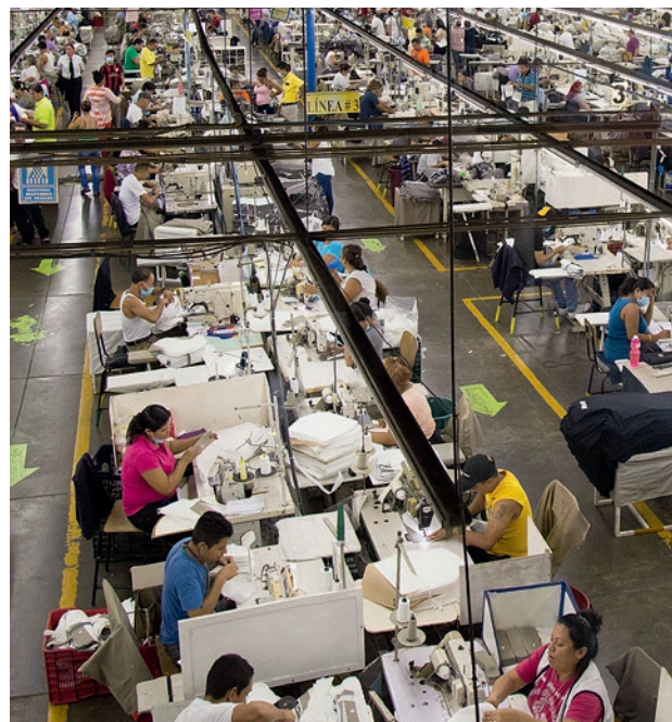
Personal and corporate income tax play a significant role in middle and upper income countries with a large formal sector.

While a fairer sharing of the taxation of multinational corporations between developed and developing countries is thus much desired, there is little that a single developing country can do by itself to change the global tax standard. There is, however, one area of taxation of international business in which SPF supporters in government, the legislature or in civil society can by themselves (or jointly with local tax justice supporters 19 ) seek to stop the erosion of the tax base. This involves what is called the “race to the bottom” in which governments compete with other governments to attract foreign investors by offering increasingly generous special tax privileges, such as “tax holidays” during which no tax is owed or special reduced tax rates that apply indefinitely. Sometimes the cost in foregone taxation well exceeds the gains