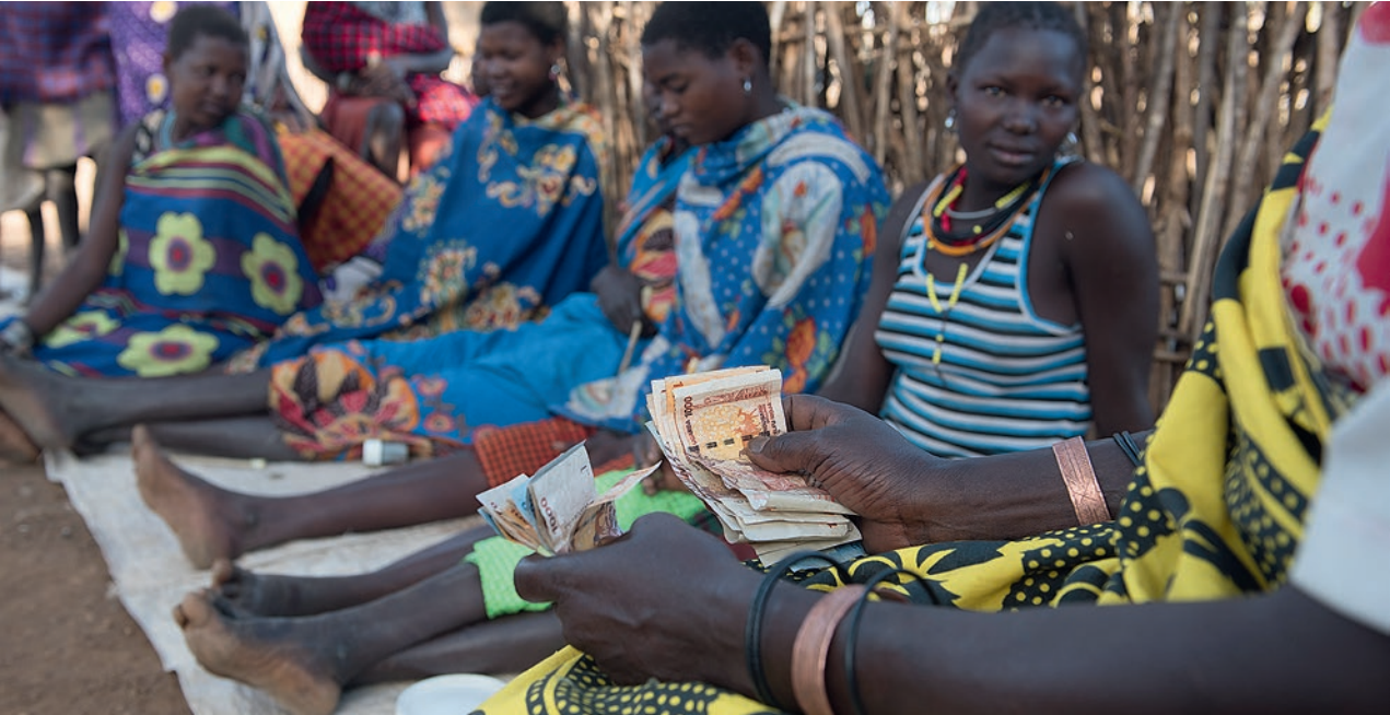
Reduction of tax evasions helps to free resources for social protection spending.

The specific assets must first be identified as owned by the family of the corrupt official, itself often a challenge with various national jurisdictions providing “safe havens” to hide the beneficial ownership of particular assets. Once identified, a complex legal process is needed before the government where the assets are located agrees to return them to their origin country. Efforts are underway to speed up this process, but data for 2010–2012 indicate the challenge: out of US$1.4 billion in identified and frozen assets, only US$147.2 million had been returned to the countries of origin (IATF, 2017, 44).