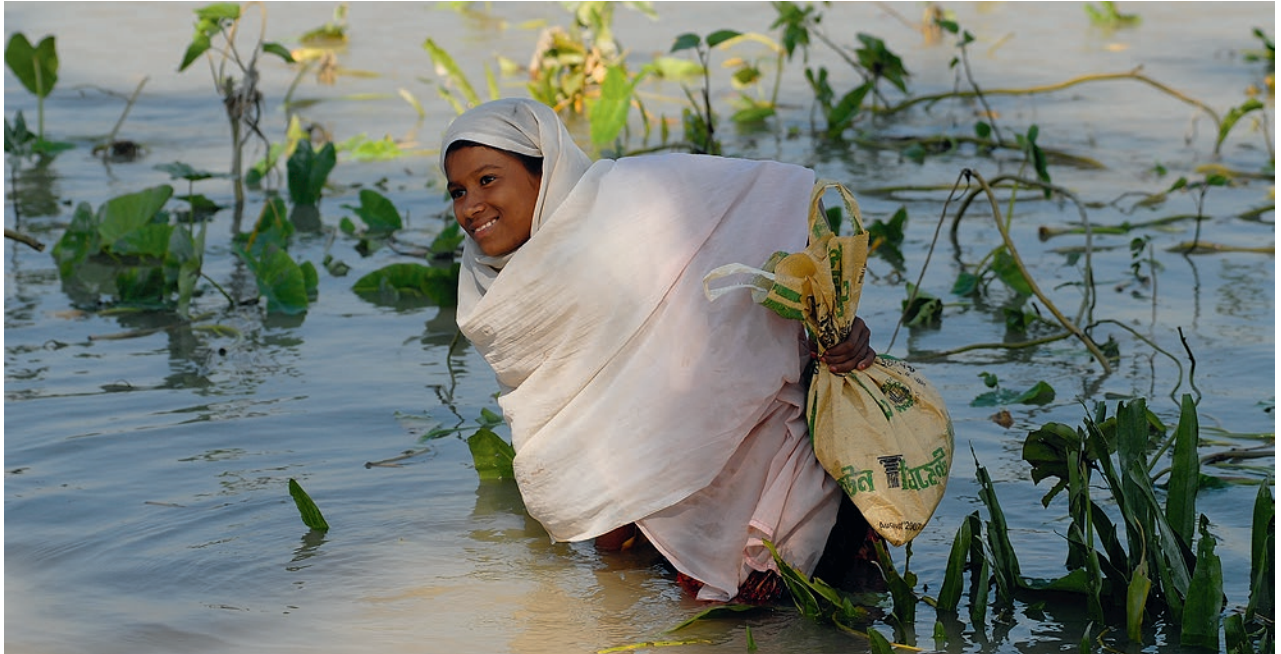
Social Protection Systems can serve as vehicles through which to put additional cash into the hands of people affected by catastrophes. A cyclon plus storm tide destroyed coastal villages in Bangladesh like the home village of this woman.

of over 50 international agencies, 9 although developed countries collect the highest share of GDP in taxes, the median “tax take” has risen in all groupings of countries since 2000 and the gap between developed and developing countries has shrunk (IATF, 2017, 30). The largest jump in the tax to GDP ratio has taken place in the least developed countries (LDCs), whose median rose from less than 10% of GDP in 2001 to 14.8% in 2015, the last year for which fairly complete data were available. Nevertheless, as the IATF report highlighted, research suggests that countries with a tax to GDP ratio below 15% seem “to have difficulty funding basic state functions” and half the LDCs have ratios below that indicator, or about 10 percentage points of GDP below what many rich countries that enjoy universal social protection systems collect on a routine basis.