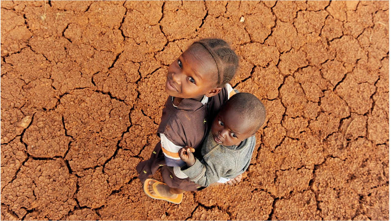
Social Protection Floors include basic income security from childhood to old age and access to essential health care for all. An inclusive child grant would help realise the right to an adequate standard of living for these children in southeastern Kenya.

handle what would otherwise be a shortfall in contributions. Alternatively, universal payments could be fully financed out of general tax revenues, with the requisite resources collected through the tax system without distinguishing contributions from income tax payments. The central point is to draw our attention in this paper to the need for effective, fair and sustainable ways to mobilize the requisite fiscal resources to cover the cost.