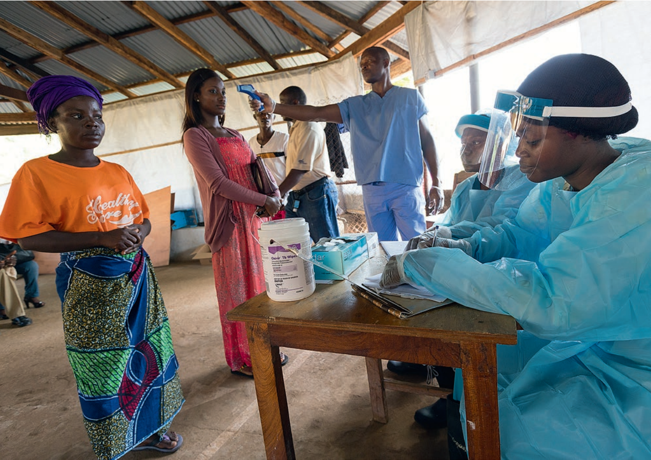
The Ebola pandemic devastated Liberia, Guinea and Sierra Leone so because of the absence of functioning health-care systems in parts of these countries and because of the slow international response to the crisis.

companies that had been used to launder money, hide money and evade taxes. Further policy development in identifying beneficial owners of companies (and their bank accounts) is one priority area in which to deepen intergovernmental cooperation, but it is one among many areas. Increasingly, all in all, developing countries and their aid partners are focusing on more effectively chasing the tax cheats. 42 Effectively doing so will not only collect more tax revenue per se, but may also make it harder to be a successful tax cheat and thereby discourage further tax cheating attempts.